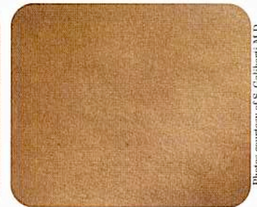
Buttock after one TriActive Tx