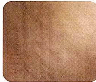
Buttock before Tx